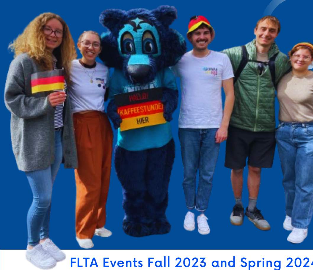
FLTA Events Fall 2023 and Spring 2024

Of these 23 colleges, only two are located on the West Coast and there is only one school in California : SSU. SSU is the only university in the CSU system that has been hosting a Fulbright FLTA. This program offers SSU students the unique opportunity of learning the language with a native peer and experiencing contemporary German culture. Unfortunately, SSU is currently unable to provide funding for this internationally recognized program promoting international education for our students.